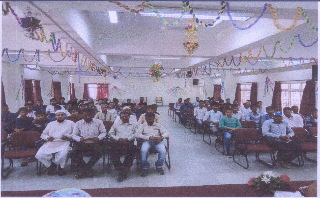
View of participants.